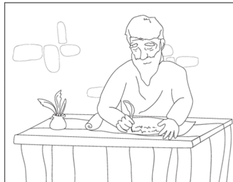
Paul Writing a Letter